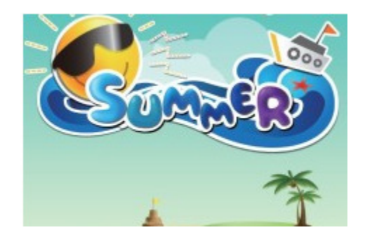
Have a GREAT summer!

A BIG "Thank You" to those who pick up trash every morning off the streets. You are truly good neighbors.