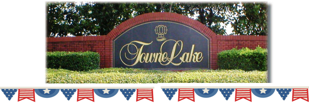
Towne Lake Homeowners Association - July 2015